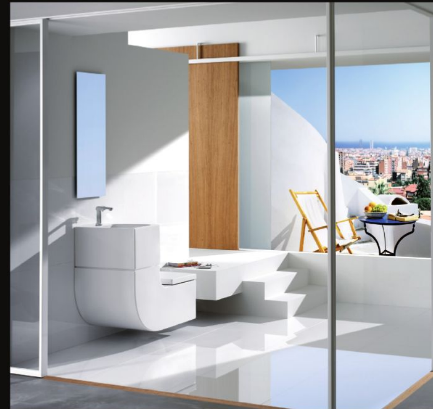
Designed by: Gabriele and Oscar Buratti

W+W brings together design and sustainability by combining the toilet and washbasin in one single piece. Complemented by the Singles-Pro tap this solution is the logical choice for situations where sustainability and design excellence are top priority.