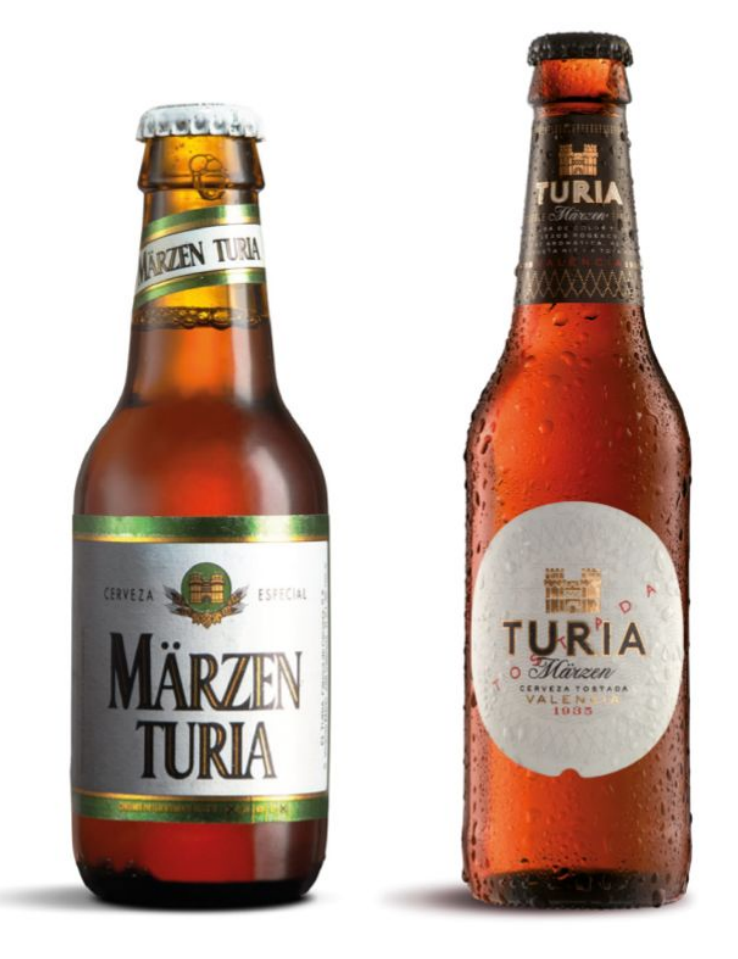
Out of the many varieties, Turia Marzën has succeeded in lasting until today because of its genuine character.