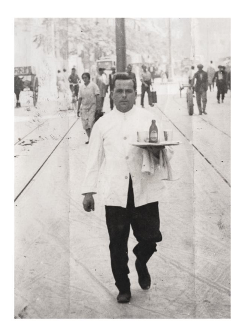
For decades, many households and establishments have toasted with the brewer's brands including Stark, Golden Bier and today's Turia Marzën.